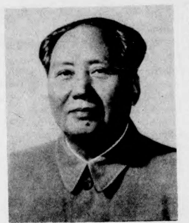
The man whose death sparked the current turmoil in China, Mao Tse-Tung.

In the Cultural Revolution, Mao emphasized the importance in distinguishing contradictions between enemies and contradictions between friends. The Gang of Four according to Hinton, was more inclined to denounce anyone who opposed them as "capitalist roaders" and "revisionists".