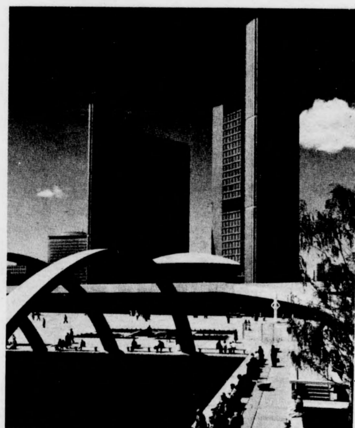
Nathan Phillips Square is a good place to go on New Years Eve.