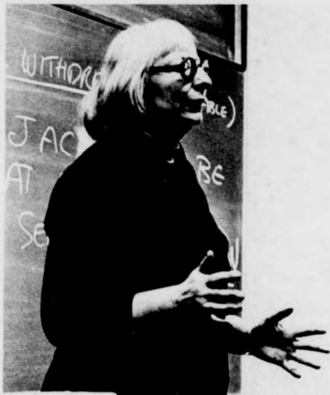
Jane Jacobs, former New Yorker, believes that although cities will continue to grow larger, they will be able to support a creative life for urbanites. She holds short shrift with Lewis Mumford's pessimistic view on the inevitable decline of cities. "Well, Mumford doesn't really like cities anyway."

Jane Jacobs likes, no, she loves T.O. She even decided to move here from New York and settle near the Kensington Market area. She's the girl who wrote The Death and Life of Great American Cities .