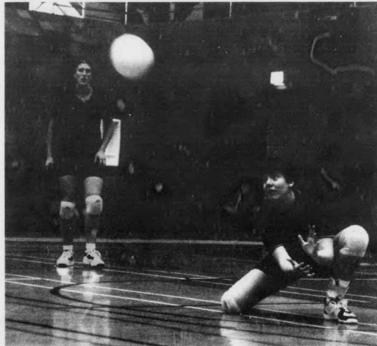
Weekend action from the Pit.