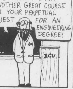
THIS COURSE HAS THREE PREREQUISITES, AND TWO CO-REQUISITES, YOU HAVE TO SHELL OUT ANOTHER SIXTY CLAMS AT THE BOOKSTORE FOR THE TEXT, THERE'S WEEKLY ASSIGNMENTS AND LABS, WE COVER

GREETINGS ONCE AGAIN! IT'S TIME TO START ANOTHER GREAT COURSE IN YOUR PERPETUAL ENGINEERING