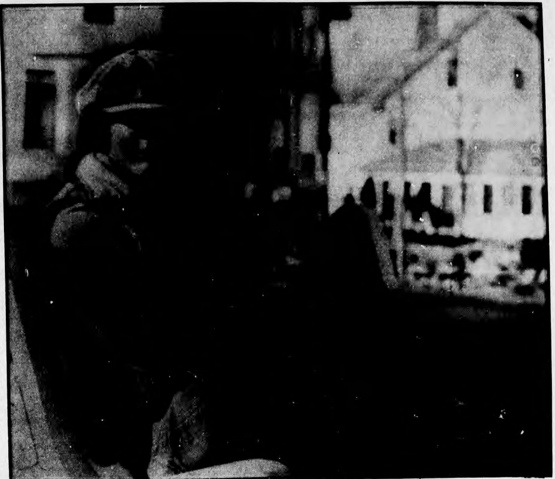
TODAY'S LOOK — Casual is the word this spring. Blue jeans, well-worn jackets and a Dylan cap made for the 80s man.

Following the cancellation, a spokesman for the network said it is not engaged in developing a new 'soap.' It will be called "Another Nackawic" and will concern itself with life (especially the seamier side) in a small New Brunswick town. On location filming will begin in May.