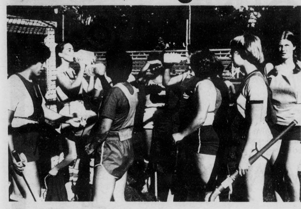
-The gals hit the water as high humidity takes its toll at the women' field-hockey tryouts underway at College Field. The Red Sticks travel to Presque Isle this weekent to open their season.

The Red Sticks Field Hockey Team is in its initial stages as tryouts continue until Tuesday Sept. 11/79. A group of prospective players attended a tournament in Maine last weekend hoping to gain some valuable playing experience before the final cuts are made. Their record while there was 1-1-4 and marked improvement was seen over the weekend.