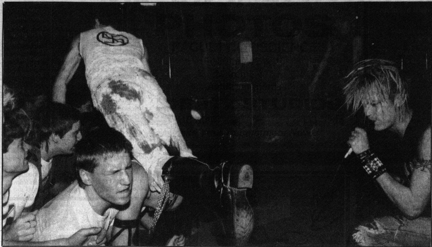
Slam dancing was de rigueur at the CJSR birthday bash last Friday night at Dinwoodie's