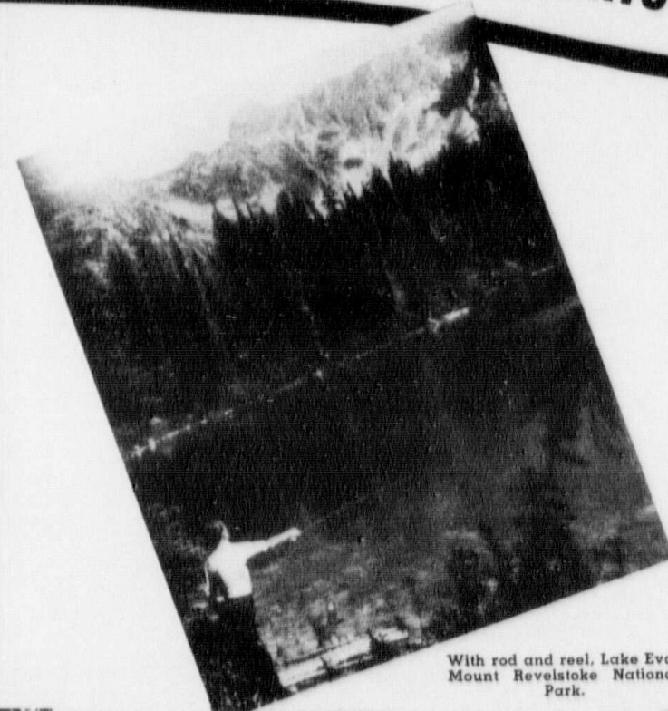
With rod and reel, Lake Eva, Mount Revelstoke National Park.