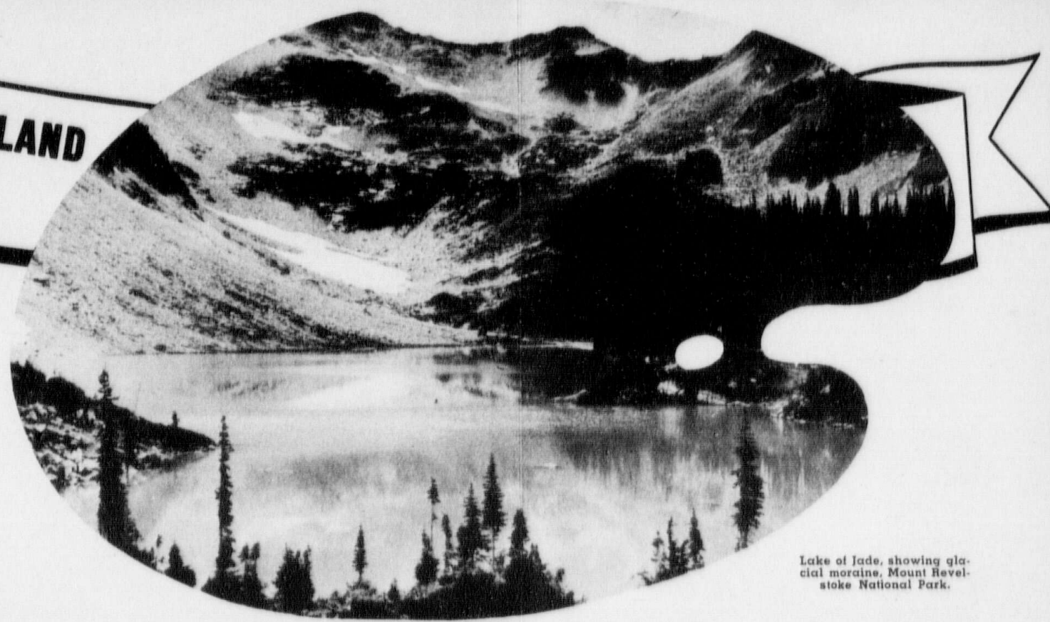
Lake of Jade, showing glacial moraine, Mount Revelstoke National Park.