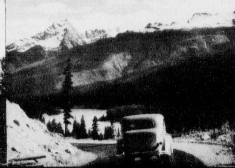
Frenchman's Cove and Columbia River from Big Bend Highway.