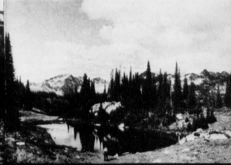
Heather Lake at summit of Royal Highway, Mount Revelstoke National Park.

RG 84, A-2-a, Vol. 16 File/dossier, MR109 pt 1