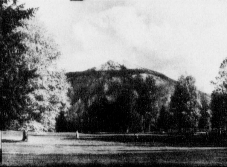
Revelstoke Golf Course and Mount Mackenzie.