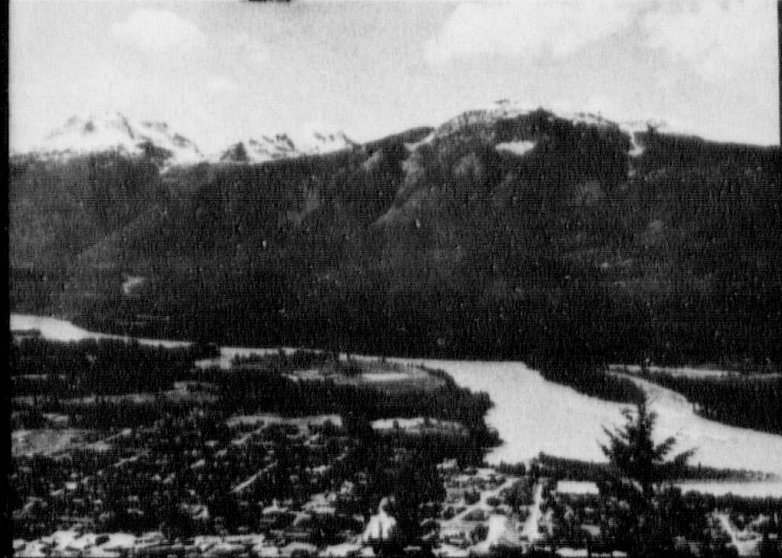
Revelstoke from the Royal Highway, showing Mount Begbie and Columbia River.