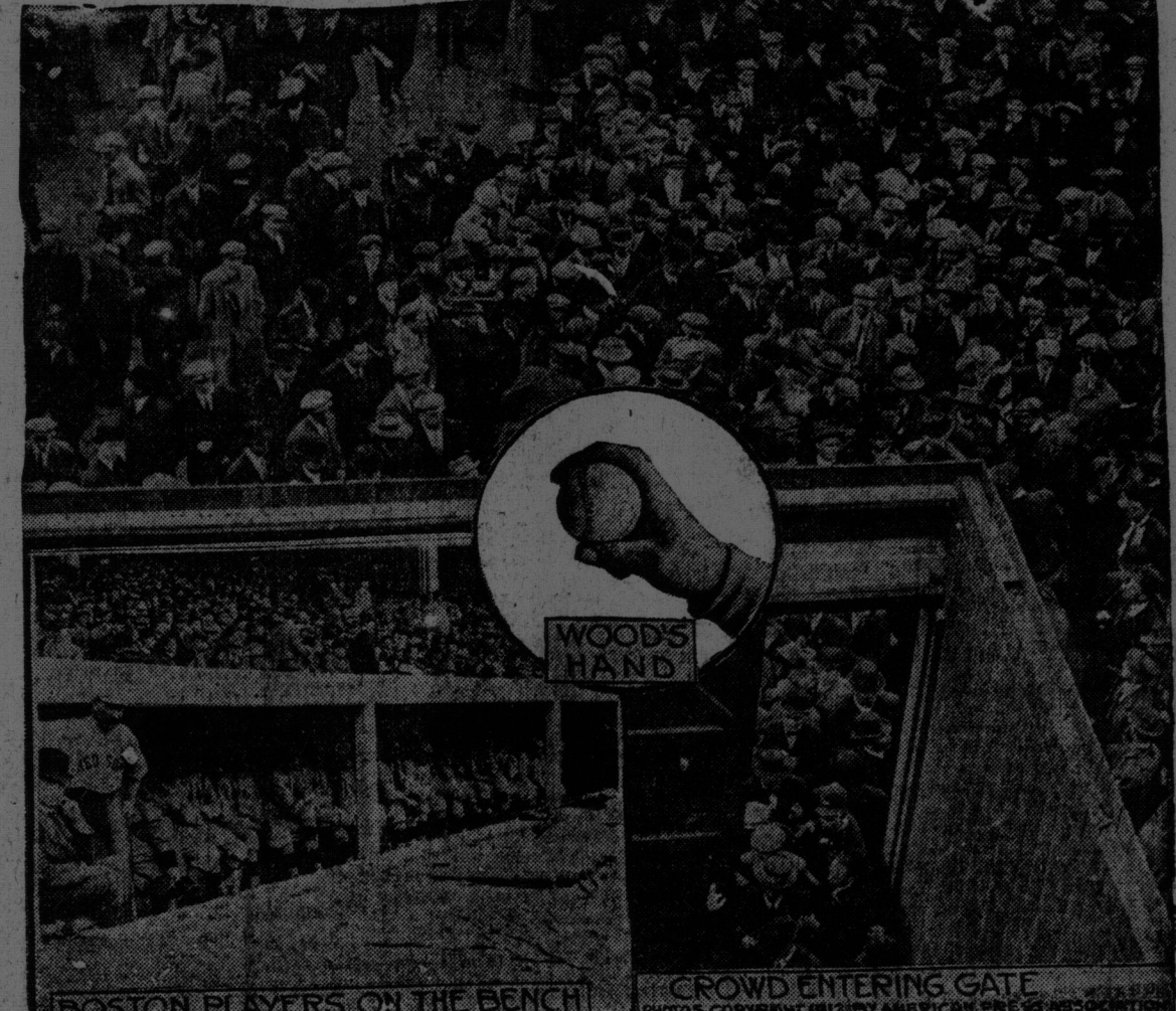
Boston, Oct. 16.—All records for attendance in the first five games of the world's championship. Total paid attendance for five games was 171,087, last year's figures being 138,245. Total receipts for five games, $58,483, also a new record, as one game, the total was $28,252.50. These receipts are divided as follows: players, $147,571.70; clubs, $155,262.70; national commission, $33,948.80. In the small picture Joe Wood's hand is shown gripping a ball to throw an inshoot.

The tenth inning, which was still uncompleted when the game ended, was Mathewson's word in delivery. He tossed 27 balls to the batters in that inning, but the Sox, led by their pitcher, won the game.