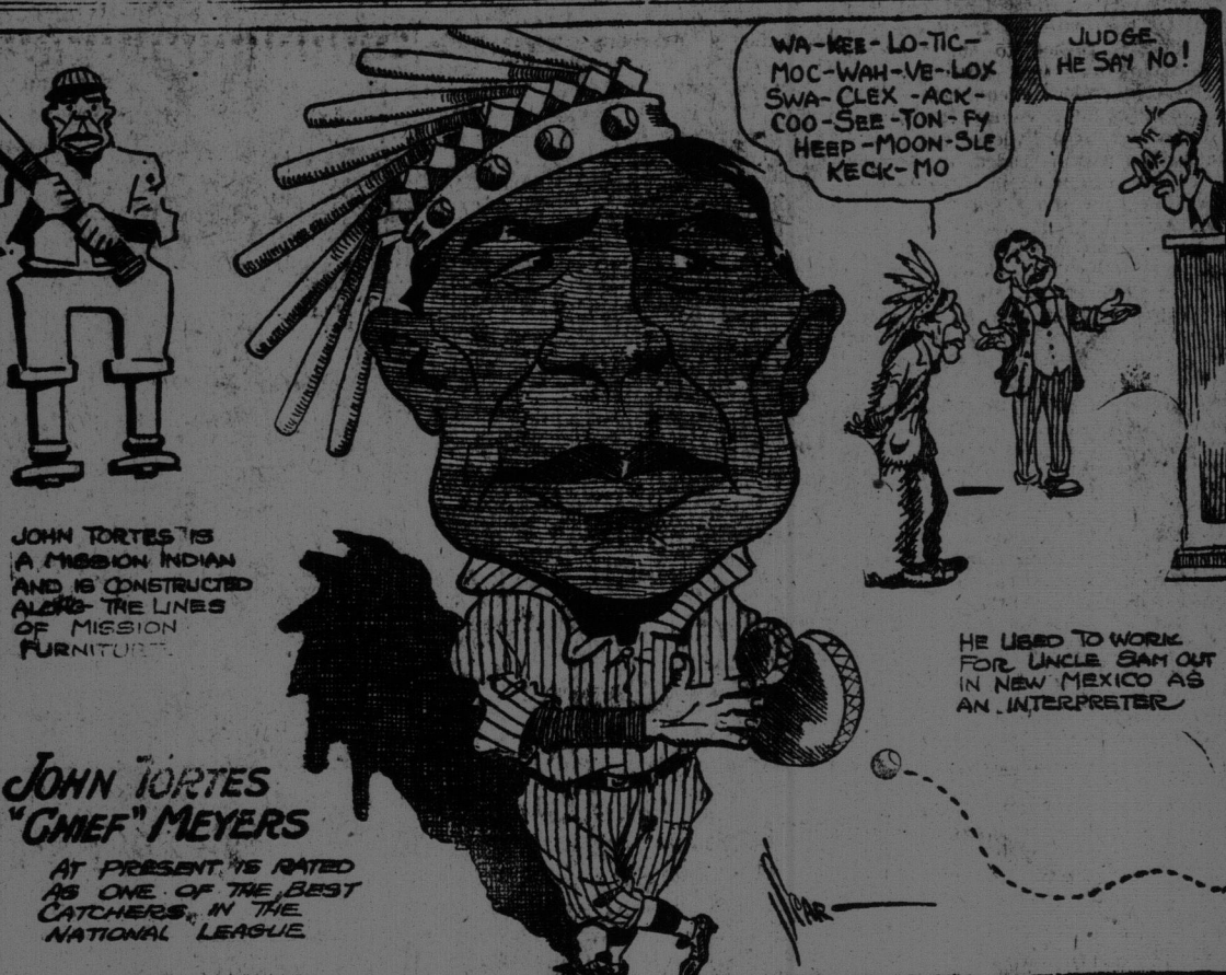
"CHIEF" MEYERS, HARD HITTER OF THE GIANTS

Copyright, 1913, by the Wheeler Syndicate, Inc.