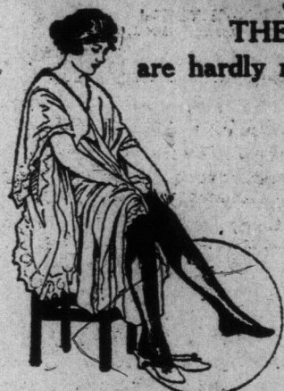
Women's Cashmere Stockings, 65c Mill overmakes of $1.00 quality in plain black. Seamless. Hosiery Sale, 65c.