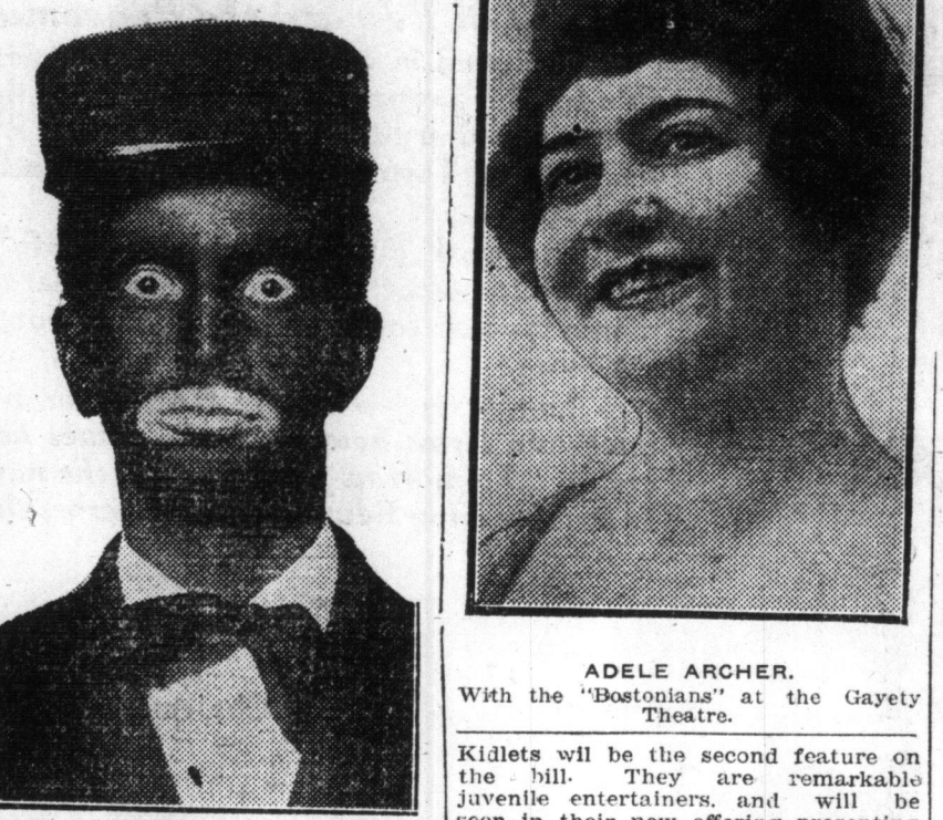
AL JOLSON in his great character of "Gus" in "Dancing Around," at the Alexandra this week.

"Dancing Around" at Alexandra. "Dancing Around," the practically all-English musical production from the Winter Garden, New York, with the formidable Al Jolson as its shining star, with its drove of "dainty, dimpled, diaphanous divinites," and four carloads of scenery, arrived in Toronto this morning to fill its local engagement at the Alexandra, commencing tonight. In "Dancing Around," there is said to be every form of dance, fox trot, aerobic dancing, ballroom games, comic sketches and farces, a plot; also Jolson does his best to spoil it on all occasions. There are 25 big song hits.