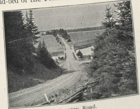
A Country Road.

have not the pleasantest recollections of the train service and the road-bed of the Prince Edward Island Railway. It