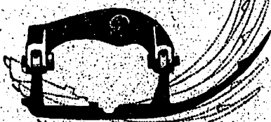
THE DOTTED LINES SHOW THE WIDE RANGE OF TILTING ADJUSTMENTS.