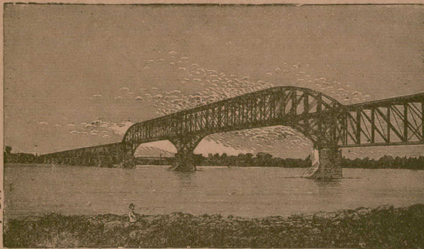
ST. LAWRENCE RIVER BRIDGE, CANADIAN PACIFIC RAILWAY, LACHINE, P. Q.

Railways and Highways Iron Bridges, Turntables Iron Piers and Trestles Bridge R. ds Right and Left Hand Sleeve Nuts and all kinds of Structural Iron Work.