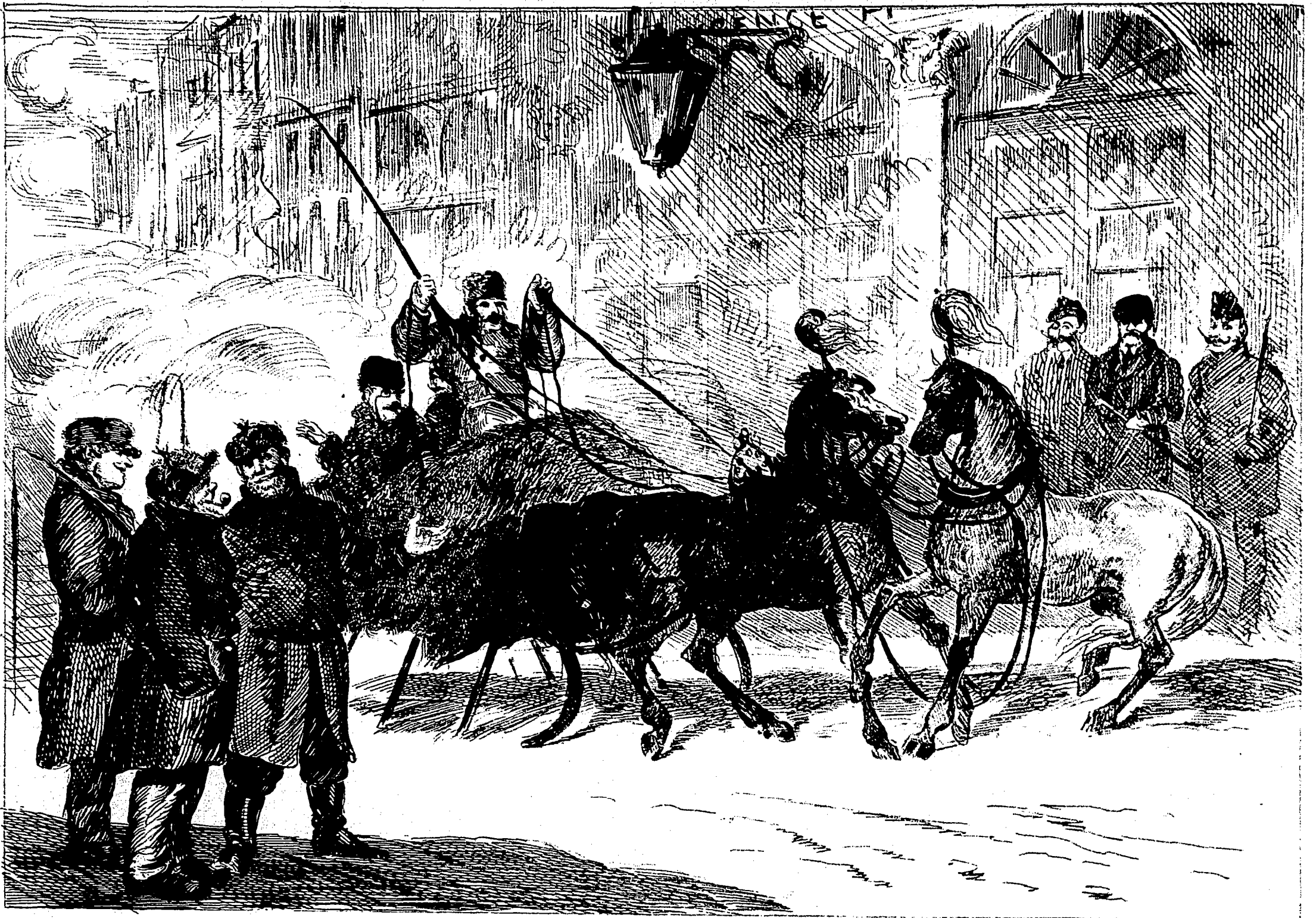
LEADER TO WHEELER.— How is this for tandem?