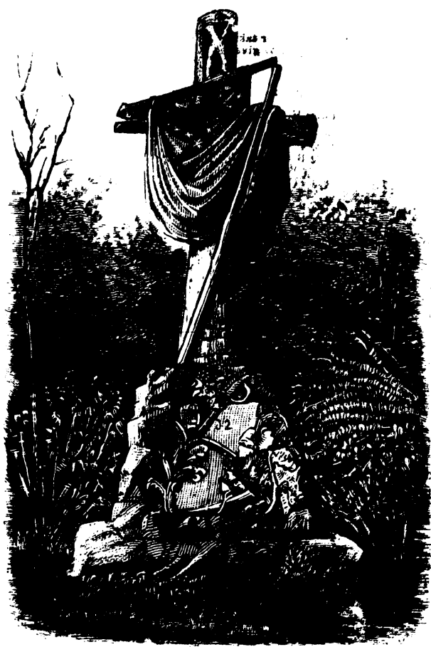
CONFEDERATE MONUMENT AT LEXINGTON, KY.

20 Lovely Rosebud Chromo Cards, 20 Floral Motto, 20 Humming-Bird Chromos, or 20 Gold and Silver Chromos, any of the above sent post-paid, with Name, 10c.; 6 Packs for 50c. Nassau Card Co., Nassau, N.Y.