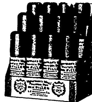
Wood or Nickel Travelers' Fillers

TRAVELERS' FILLERS are furnished by the dozen with counter display case. Weight, 6 lbs.