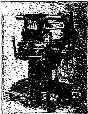
No. 2 Universal Gear Feed Milling Machine.

Complete line of Horizontal and Vertical Millers to meet every requirement.