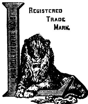
Lion "L" Brand.

Leading Dealers from Ocean to Ocean Handle these Goods.