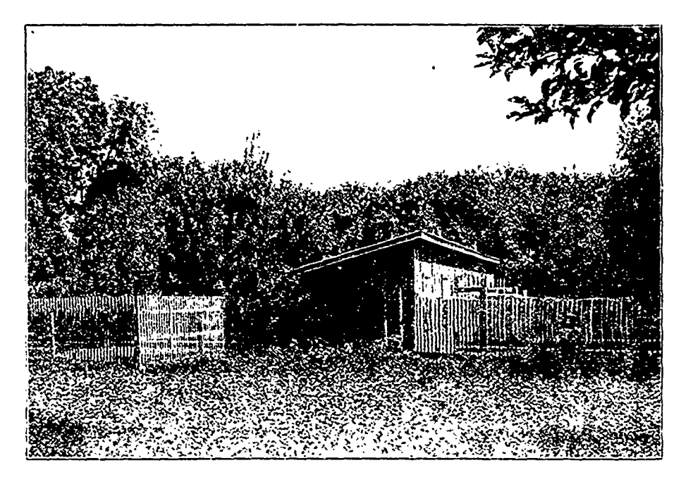
A beautiful shady place for rearing chickens.

SHOWING SOME OF THE PRACTICAL POINTS IN THE BUILDINGS. ALL FROM ORIGINAL PHOTOGRAPHS.