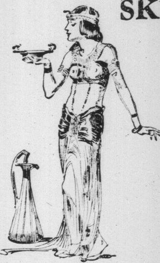
Palm and olive oils—nothing else—give nature's green color to Palmolive Soap