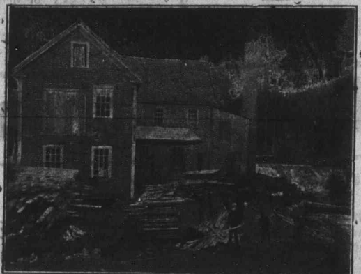
KENTVILLE PLANING MILL.

Secretary of INDUSTRIES & IMMIGRATION, P. O. Box 680, Halifax, N. S.