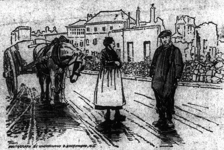
COMING BACK TO DEVASTATED HOMES.