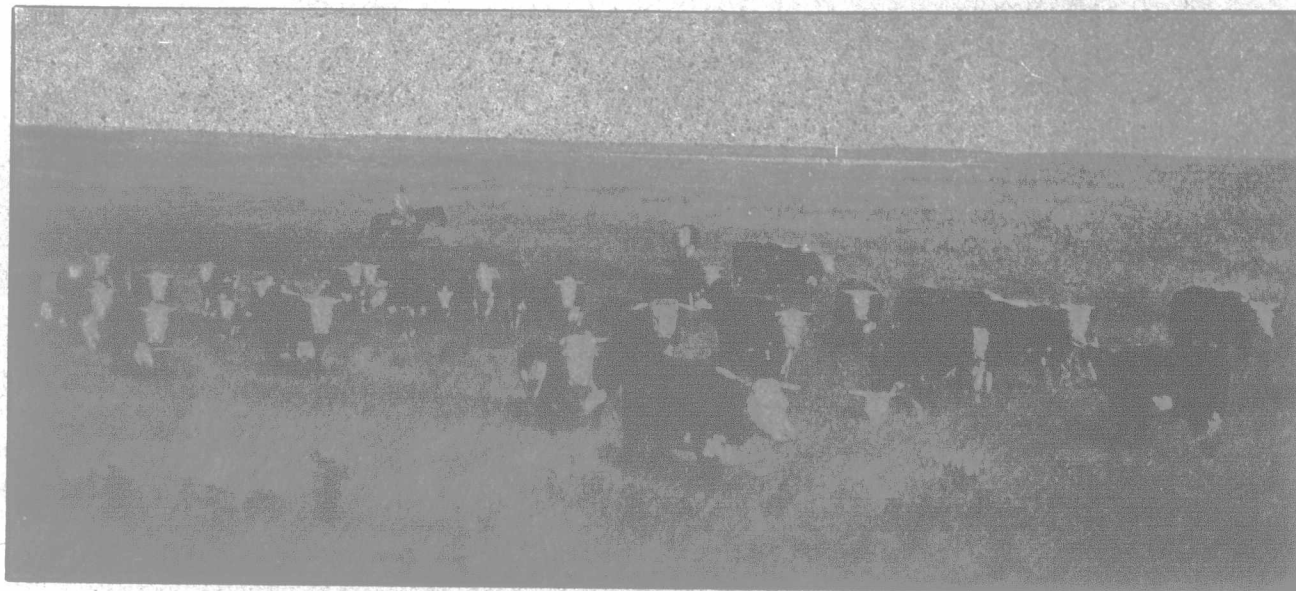
Hereford Cattle, Craze Lake, Assiniboia, Main Line Canadian Pacific Railway.

The Canadian Pacific Railway Company have 12,000,000 acres of choice farming lands for sale in Western Canada. Manitoba and Eastern Assiniboia lands generally from $4 to $10 per acre, according to quality and location. South-western Assiniboia and Southern Alberta lands, $3.50 to $8 per acre. Ranching lands generally $3.50 to $4 per acre. Northern Alberta and Saskatchewan lands generally $6 to $8 per acre.