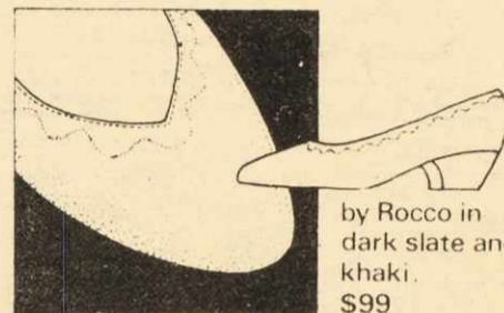
by Rocco in dark slate and khaki. $99

The Graduate House is open 6 days a week to all Graduate Students and their guests.