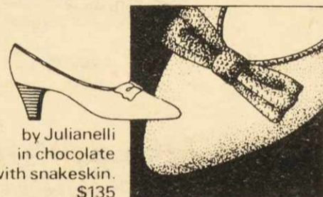
by Julianelli in chocolate with snakeskin. $135