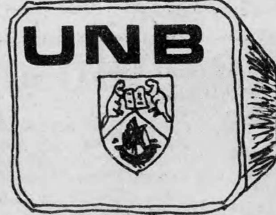
year & faculty (engraved)