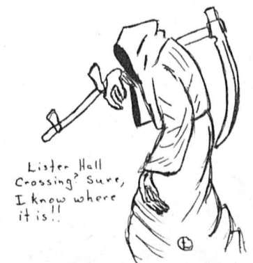
Lister Hall Crossing? Sure, I know where it is!!

The arts council is an undergraduate society for arts students.