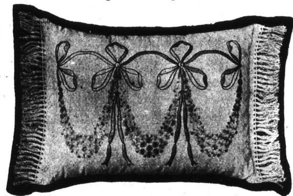
6550—Cushion, 50 cents.

stitch is taken from the centre of the flower out, instead of carrying the thread from the outer edge to next petal, commence each petal from centre. The centre