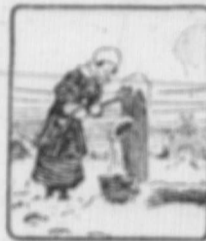
This is not a pleasant winter occupation.

Water under pressure means running water at all times in the kitchen, bathroom and laundry, and you can have it piped to any part of the farm. Wouldn't the family appreciate it? Let us know if you have windmill or gas engine. Either will supply the necessary power. "ISCO" systems are inexpensive.