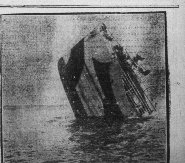
A DIVE THAT WAS SUSPENDED.—This is a picture of an oil tanker which struck a mine off the north coast of England and remained in this position for two days before it made the plunge to the bottom.