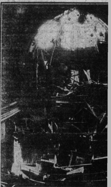
ORGAN DESTROYED BY FIRE—Debris of the organ at the Street Methodist Church, which was damaged by fire.