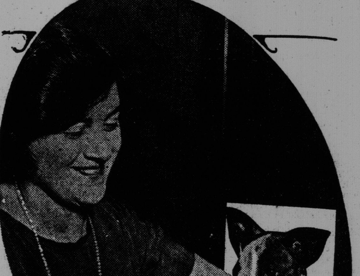
"C. O. D." is the name of this Boston bull puppy, and "C. O. D." is being held at the Chicago post office because the man to whom it was mailed from Bellevue, Ill., refused to pay the $25 charge on it.