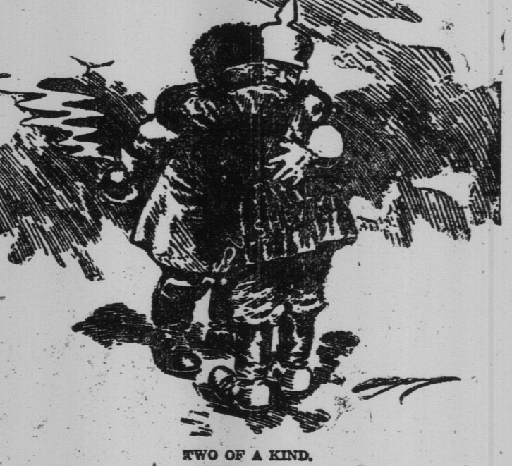
TWO OF A KIND.