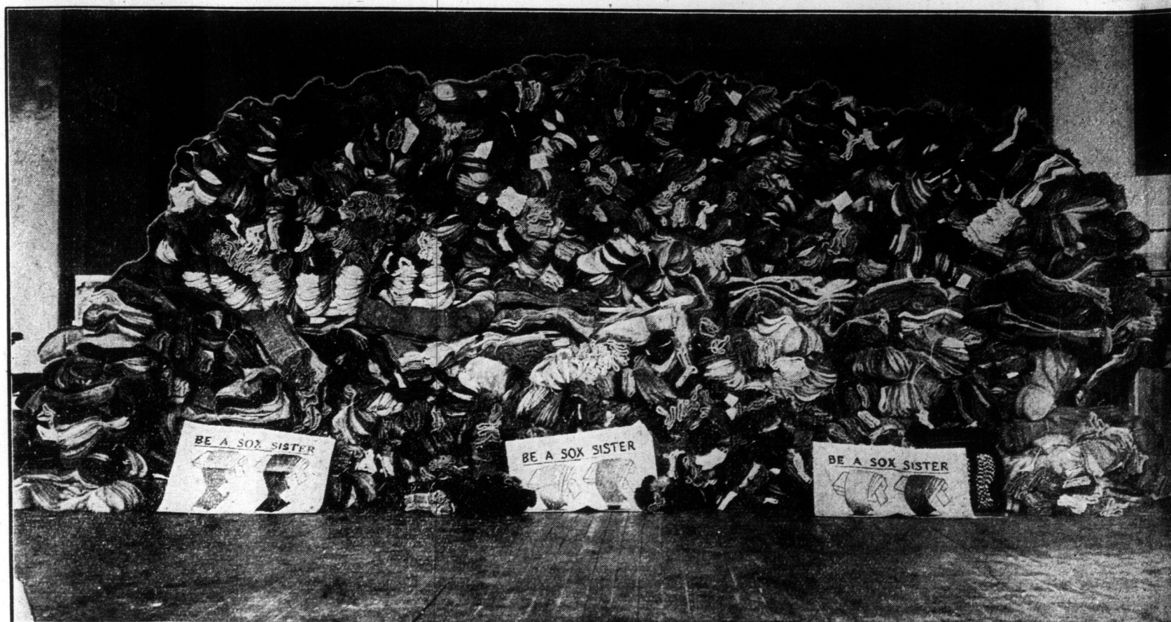
Comfort for troops at the front. Sox secured by The World Sox Fund, before being packed for shipment.