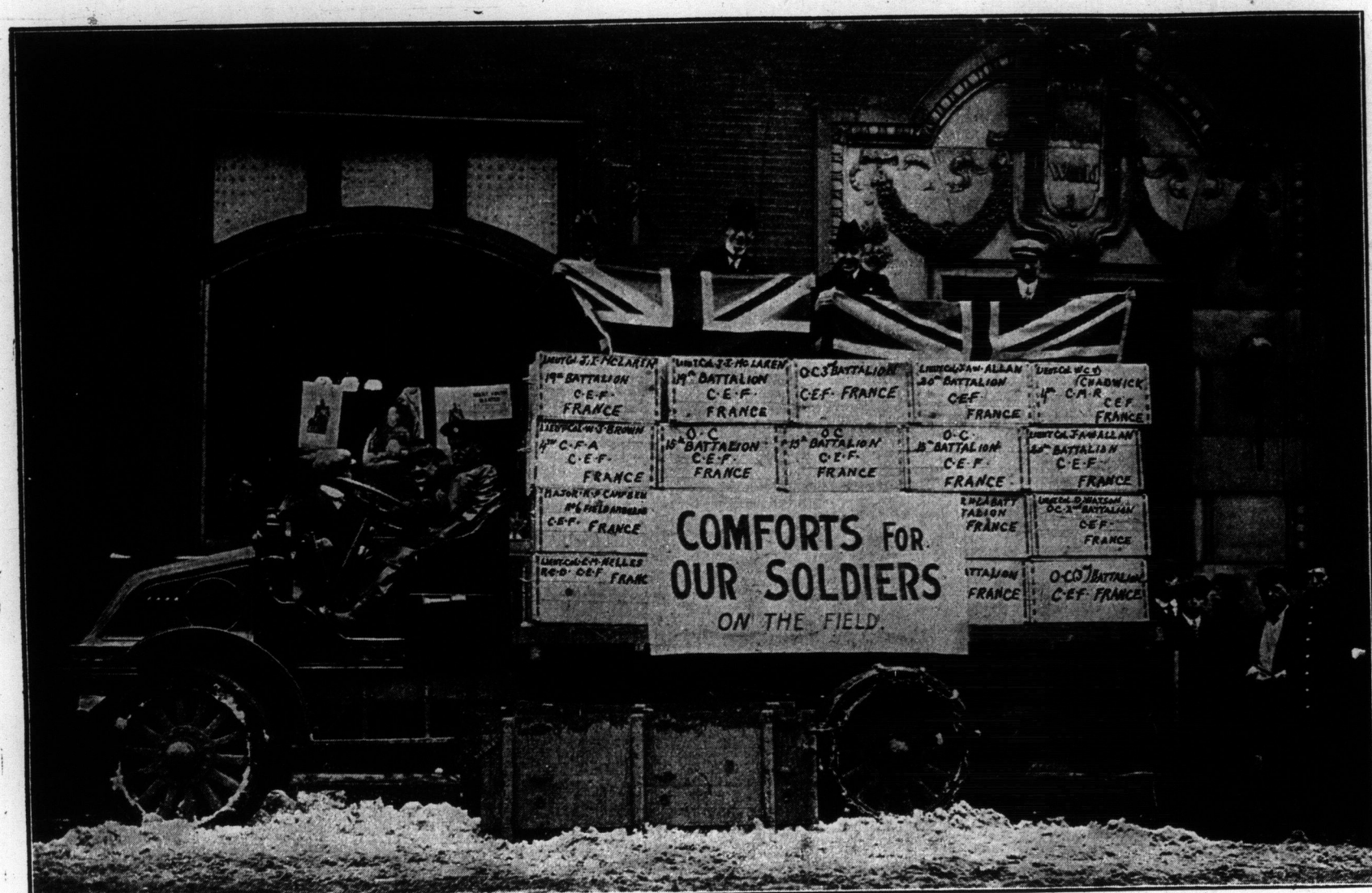
Off for the trenches. Contribution of The World Sox Fund boxed and on military motor truck in front of The World Building just before it left for the front.