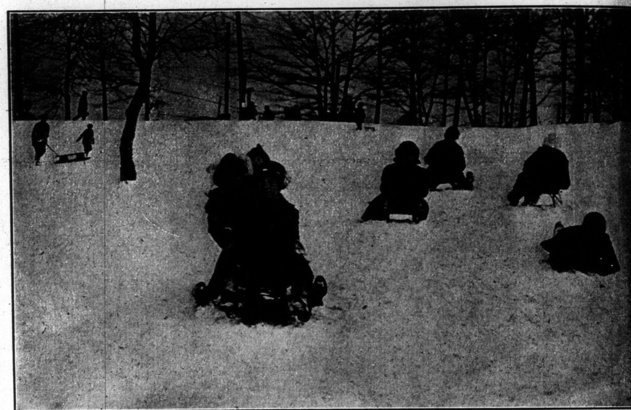
Fun on the hillside. Toronto kiddies coasting along one of the natural slides out in High Park.