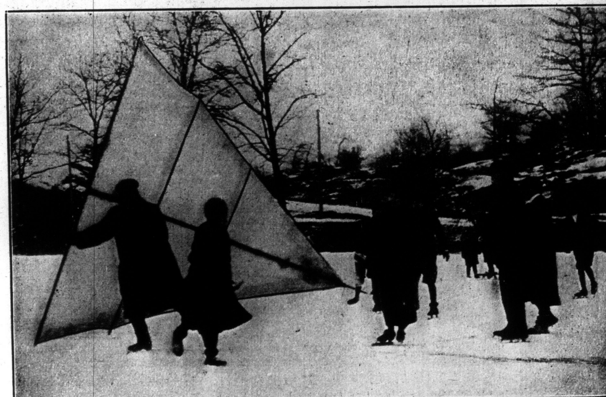
Winter sport on Grenadier Pond. Skate sailing is a pleasant pastime.