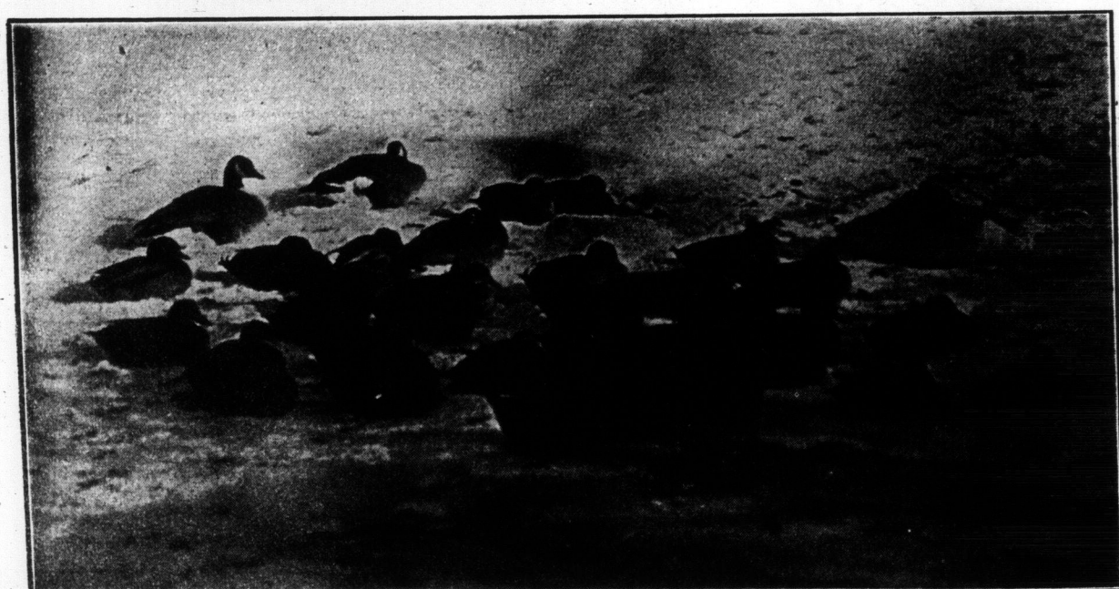
Frozen out. Wild ducks, geese and swan roosting on the ice at Riverdale Park during cold spell.