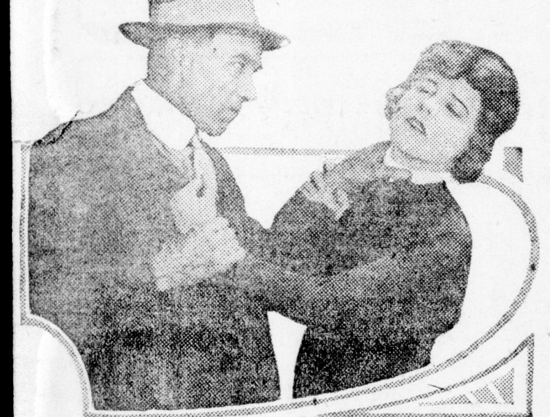
"I'll make you change your mind." ETHEL CLAYTON in "Maggie Pepper." A Paramount Picture.

Another Big Feature at Majestic Monday and Tuesday.