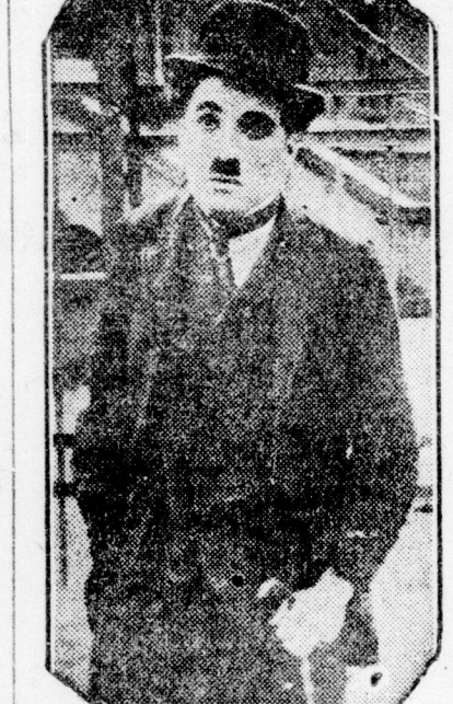
CHARLIE CHAPLIN at the Majestic today in "The Henpecked Spouse."

IT'S A DANDY. The comedy for Wednesday and Thursday.