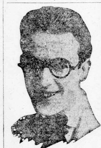
Harold Lloyd is shown at the Majestic Monday and Tuesday in his new comedy, "Under Fire."