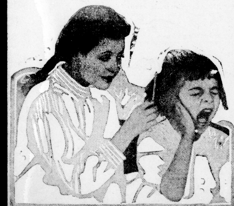
MARGUERITE CLARK in "Mrs. Wiggs of the Cabbage Patch." A Famous Players-Paramount Picture.

At Majestic Theatre Wednesday and Thursday.