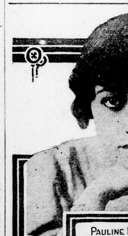
PAULINE FREDERICK FAMOUS PLAYERS-PARAMOUNT STAR

PAULINE FREDERICK COMING TO THE MAJESTIC SOON.