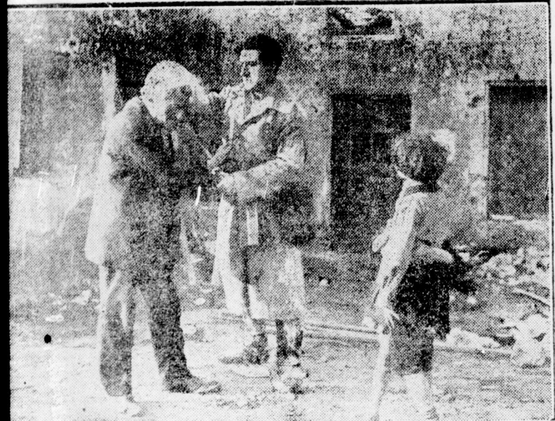
"The Kiddies in the Ruins," One of Feature Films at Majestic Monday and Tuesday in Big Double Bill.