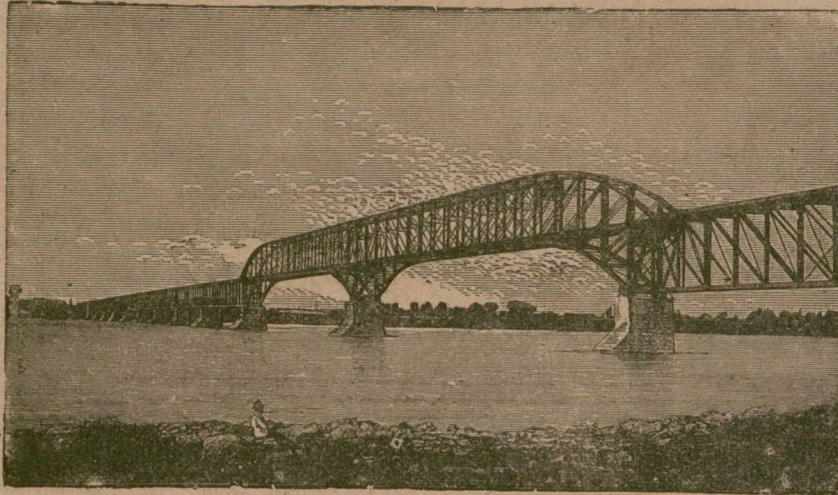
ST. LAWRENCE RIVER BRIDGE, CANADIAN PACIFIC RAILWAY, LACHINE P. Q.

For Railways and Highways, Iron Bridges, Turntables Iron Piers and Trestles Bridge Rods Right and Left Hand Sleeve Nuts and all kinds of Structural Iron Work.