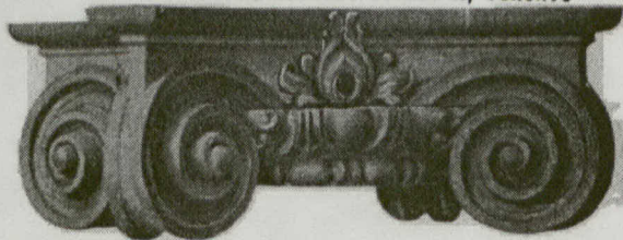
Decorations in Relief for Wall Pannelling, Etc., a Specialty WRITE FOR CATALOGUE

NOISELESS NON SLIPPERY WATERPROOF SANITARY.