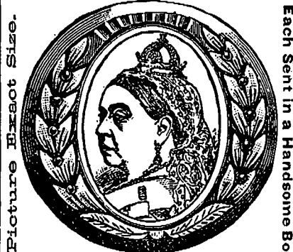
Picture Exact Size.