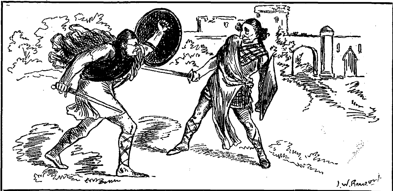
"COME ON, MACDUFF!"