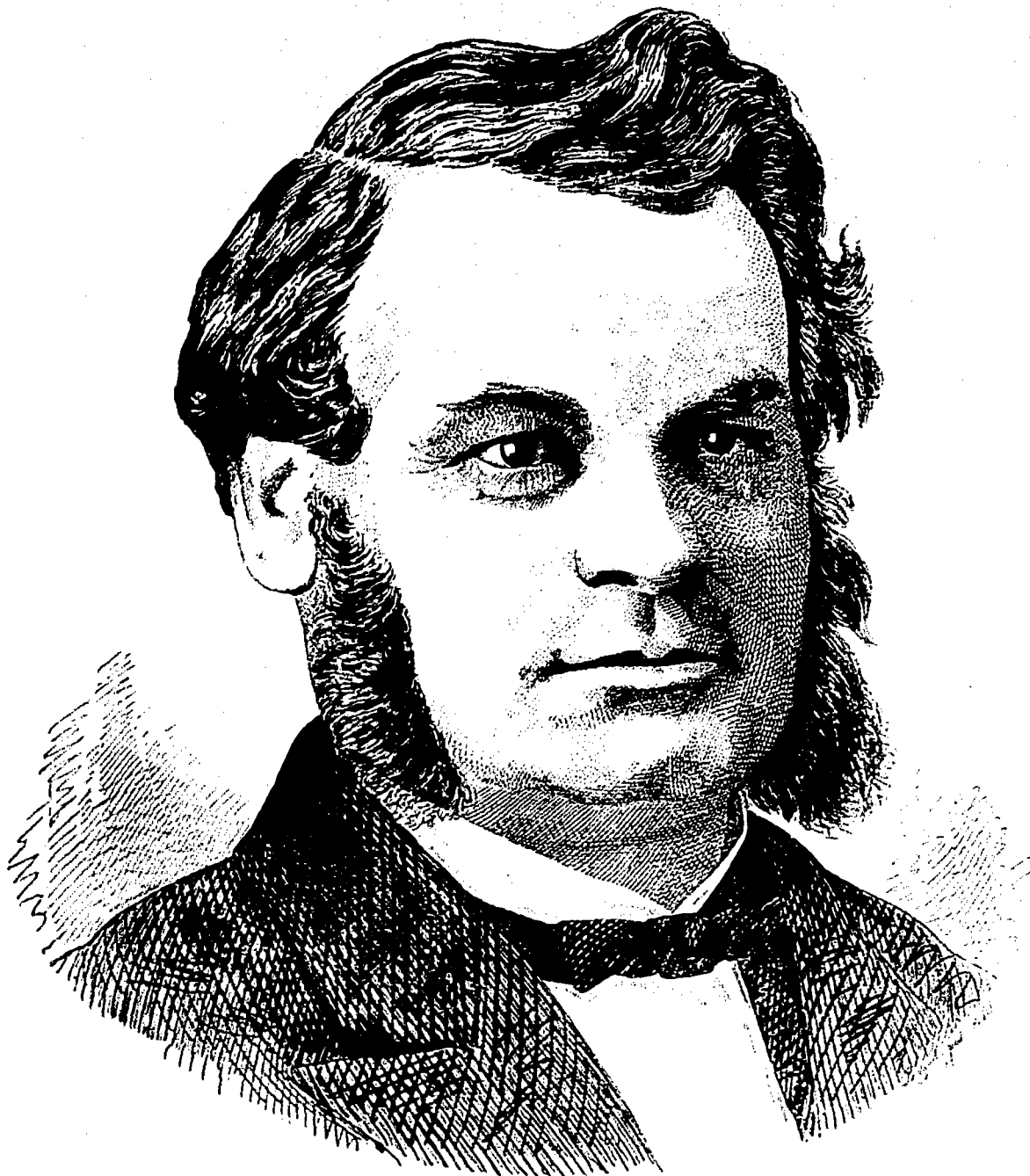
HON. S. L. TILLEY, C. B.

No. 34.—HON. S. L. TILLEY, C. B., MINISTER OF CUSTOMS.