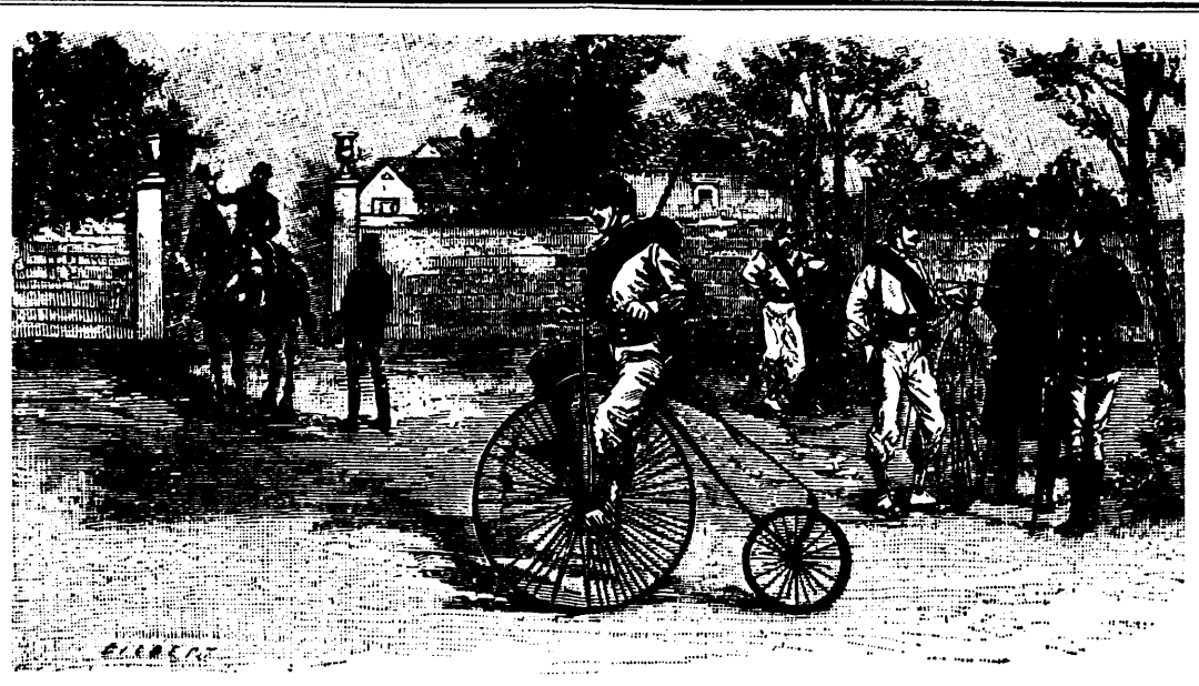
FIG. I.—FRENCH MILITARY VELOCIPEDISTS.