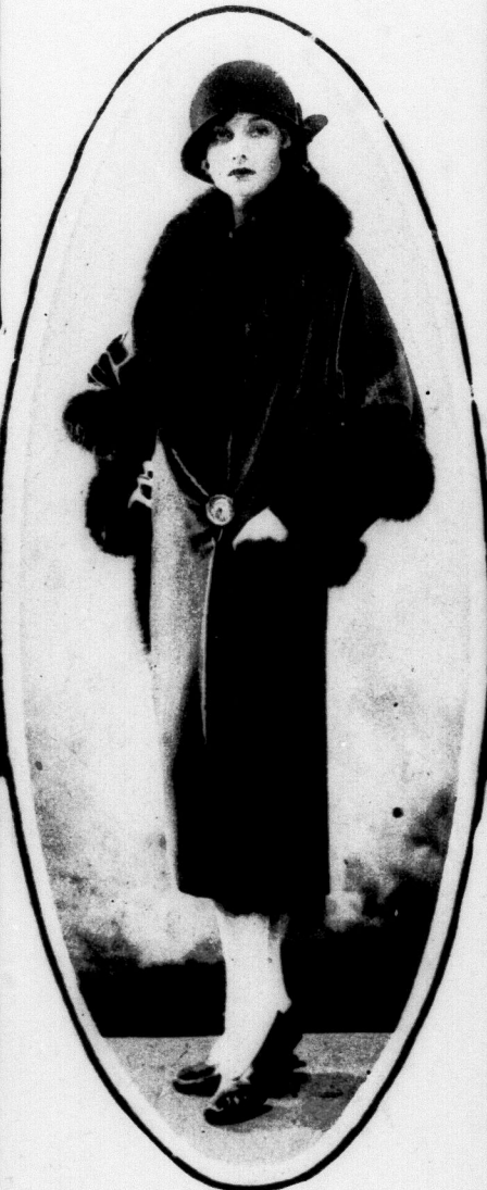
Black fox trimmings give this smart coat of fine needle point fabric an extremely gracious air of distinction