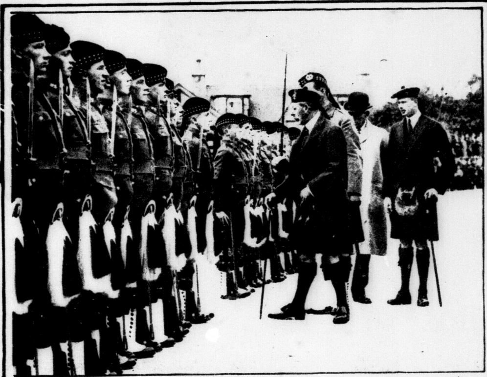
The King and Prince Henry in kilts inspect Highlanders at Balmoral Castle in Scotland