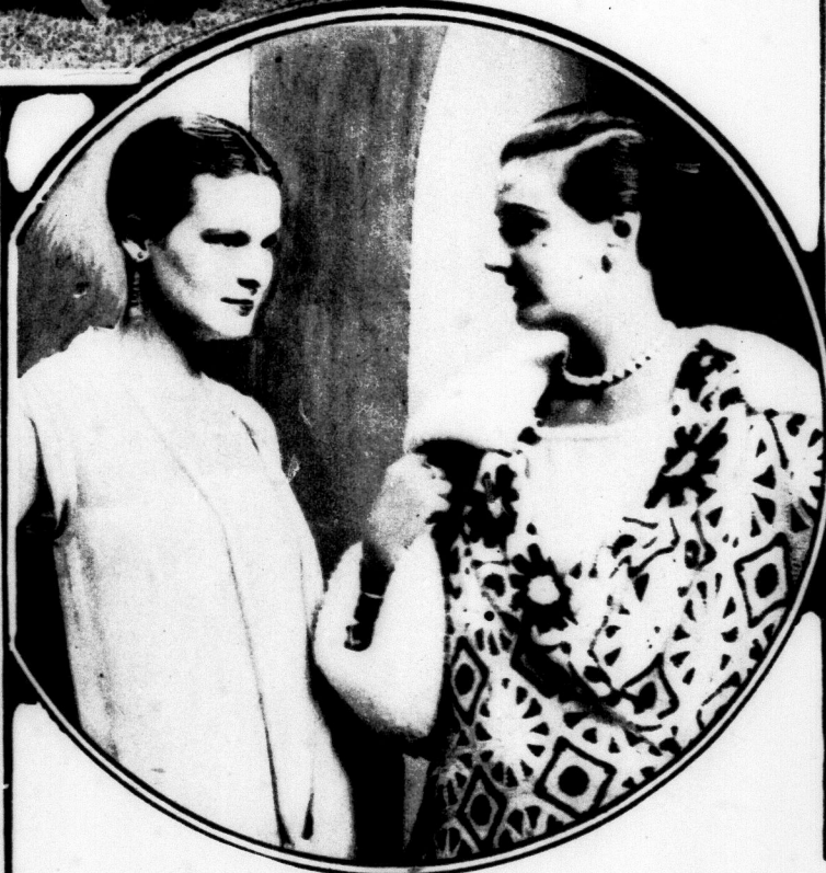
Two Eton-cropped mannequins with the latest bobs