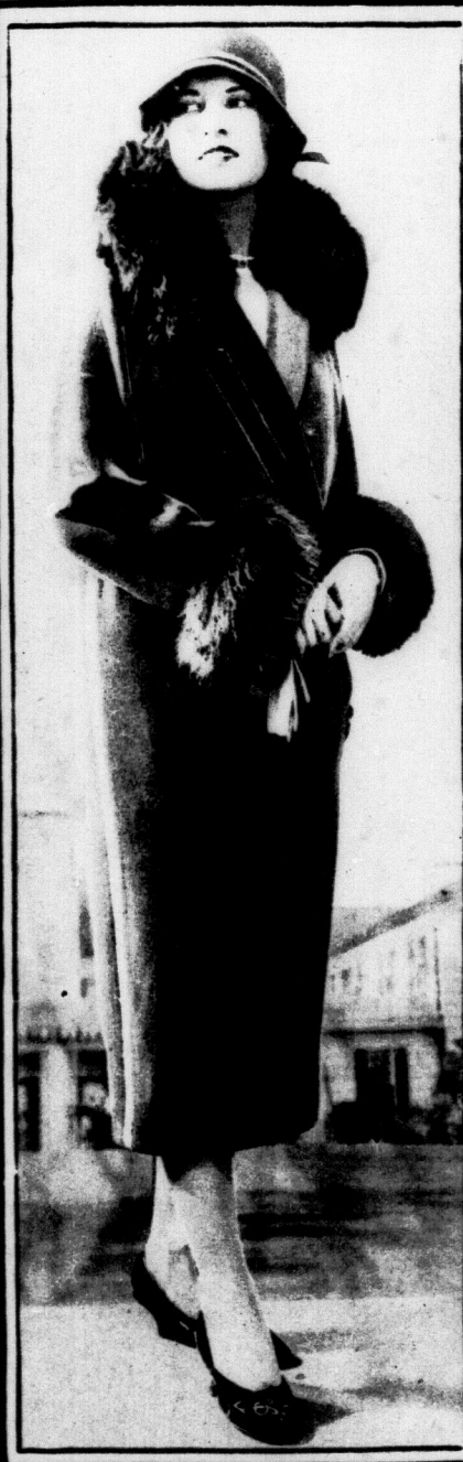
Just the coat for every day wear of dark brown bolivia with black wolf collar and cuffs