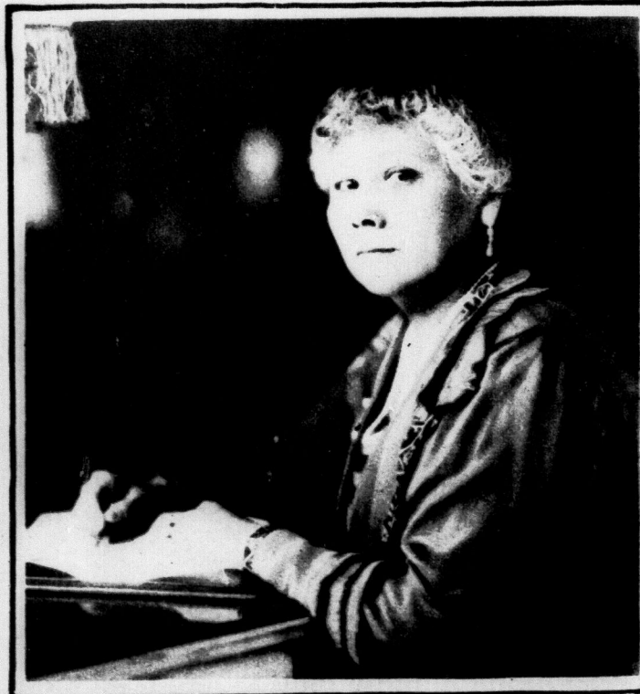
Lady Ho Tung, China's captain of silk industry