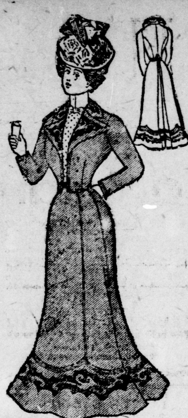
Style 947—$30 Suit for $20.

Style 549—As illustrated—made of Black Homespun Serge; coat lined throughout, fly front, raised seams and two small pockets; skirt lined throughout, single inverted pleat back; were $8.50 a suit; reduced to..... $5.00