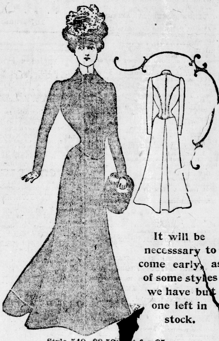
Style 549—$8.50 suit for $5.

After a heavy season's selling of Ladies' Ready-to-Wear Costumes we find that the lines are broken and that in many cases we have only one costume of each style. We have therefore decided to clear out the balance of our fall stock at greatly reduced prices. These are of the same quality and style as those we sold at regular prices early in the season. This is an opportunity that should not be missed by any lady still in need of a stylish suit.