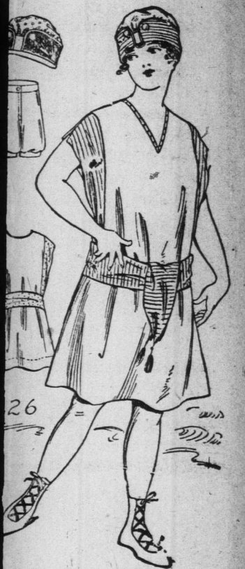
ing Suit for Ladies' and Misses (With Bloomers and Cap.)

Poplin, brilliantine, alpaca, serge, mel, taffeta and linen may be used in this model. The dress is cut skirt and waist portion in one, with side extensions forming cape over the arm. The bloomers may be omitted, and equestrian suit worn with the suit. The cap is of silk, cloth, or material to with the suit. The Pattern is in 3 sizes: 14, 16, and 18 years for girls, and in 5 sizes: 36, 38, 40, 42 and 44 inches bust measure for women. It will require 4 1/2 yards of such material for a 16 year size, the suit with bloomers, and 5 1/2 yards for a 36 inch size. The cap requires 3/4 yard of 27 inch material for either size. Pattern of this illustration mailed on any address on receipt of 10c. in stamps.