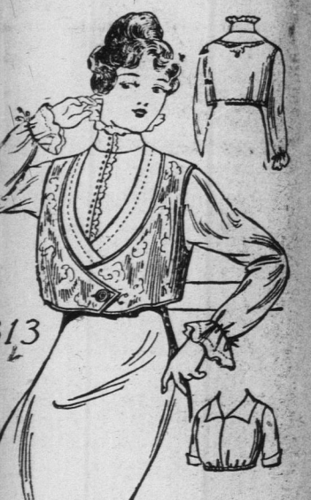
Wes' Waist, with or without Bolero, with Sleeve in Either of Two Lengths, and with Two Styles of Collar.

As here shown, brocaded silk was used for the bolero, with poplin for waist and inserts. This style is very popular for other combinations of materials, and nice for linen, lawn, voile, tulle, net and embroidery. It is very in vogue, with bolero of embroidery or silk. The Pattern is cut in 3 sizes: 34, 36, 38, 40, 42 and 44 inches bust measure. It requires 2 1/2 yards of 36 inch material for the bolero, and 3/4 yard for the bolero, for 36 inch size. Pattern of this illustration mailed on any address on receipt of 10c. in stamps.