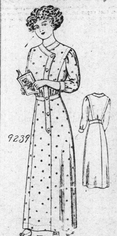
Ladies' House Dress.

In a dress of this kind a woman will always look neat while at her household duties, and if made in white or other dressy fabrics, the design will prove very appropriate for afternoon wear. The oval neck opening is comfortable and pretty, the side closing is very effective. The Gibson plait gives breadth to the shoulders, and the ¾ length sleeve leaves the lower arm free and comfortable when at work. The skirt is a five gore model. The pattern is cut in 6 sizes: 32, 34, 36, 38, 40 and 42 inches bust measure. It requires 6½ yards of 44 inch material for 36 inch size.