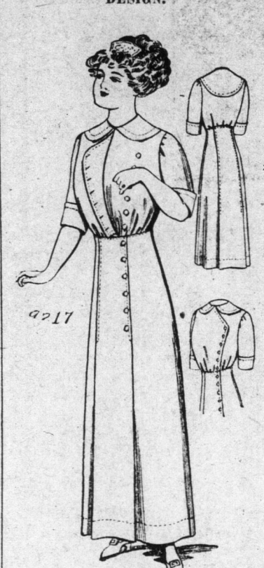
Ladies' Afternoon or Home Gown.

White cotton corduroy was used for this model, which is also suitable for silk, tulle, chambray, pique, linen and other wash fabrics. The skirt has front and back panels, with plaited extensions below knee height. The collar and cuff finish on the waist, and the revers effect are very pleasing. The pattern is cut in 6 sizes: 34, 36, 38, 40, 42 and 44 inches bust measure. It requires 5½ yards of 40 inch material for the 36 inch size.