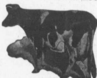
Dam of the Great "Grace Fayne" Bull Grace Fayne 2nd, mother of great stock and the notable bull shown next to her. Read adjoining article for particulars.