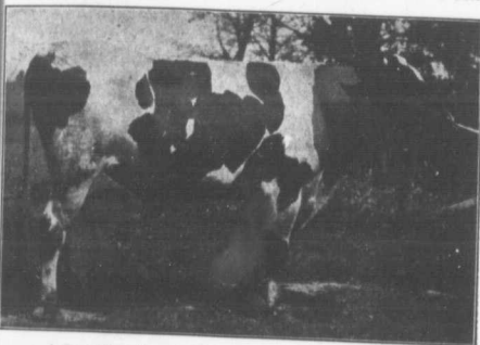
A Great Canadian-Bred Holstein from High Testing Stock

This bull as shown in the picture is not in show condition, he having been in the Ford, Ont. The blood back of him has proven itself most superior as producers of great quantities of very rich milk, almost invariably going over 4% in butter fat. He is the Canadian Champion aged cow and with a butter fat test in her milk 4.5%. You can see he is an excellent individual and would show to advantage were he fitted.