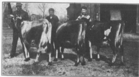
Jersey Matrons That Combine Producing Ability and Show Type

Those who claim that the Jersey cannot econ-