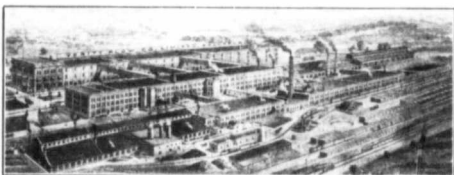
VERITY PLOW WORKS