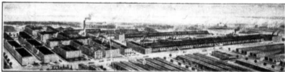
MASSEY-HARRIS WORKS, TORONTO