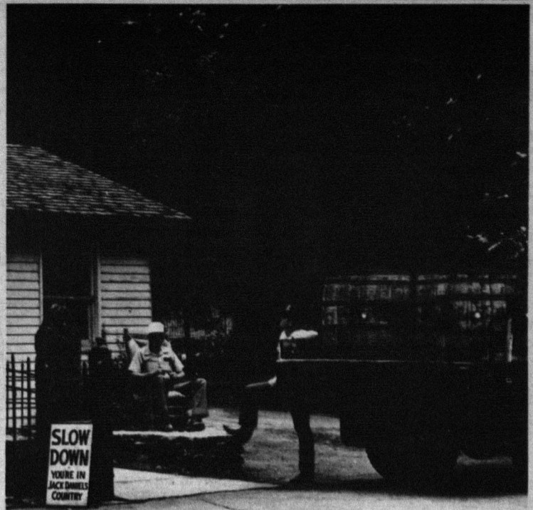
Jack Daniel's Tennessee Whiskey is represented in Canada by FBM Distillery Ltd., Brampton, Ontario

YOU CAN TELL a lot about Jack Daniel's Whiskey from the sign on our front gate. Visitors from Canada always comment on this sign and especially our quiet, unhurried way of life. You see, we make an old time whiskey here, slowly charcoal mellowed to sippin' smoothness. And we age it slowly too, over long years and changing seasons. Yes, there are faster ways to make whiskey. Many distillers employ them. But once you compare Jack Daniel's, you'll understand our reluctance to pick up the pace.